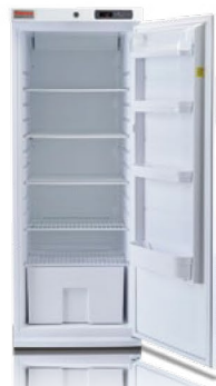
288R-AEV-TS / 288 Litre (ref)