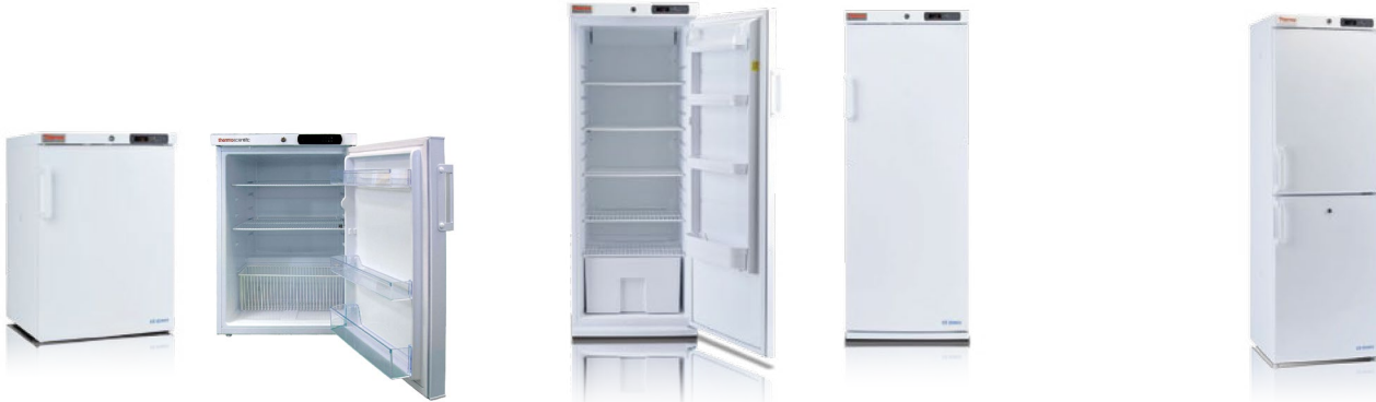
158R-AXV-TS/158 Litre (ref)

TSC models are shipped in a robust wooden crate, ideal for long-haul and multiple-stop shipping.