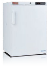
158R-AEV-TX/158 Litre (ref)

TSC models are shipped in a robust wooden crate, ideal for long-haul and multiple-stop shipping.