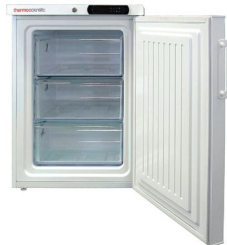
98F-AEV-TS/98 Litre (frz)